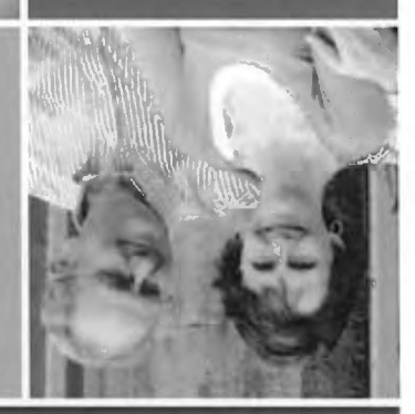
of People Millions