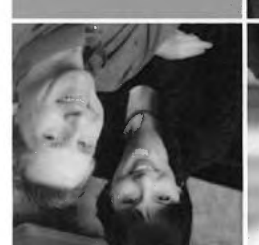
<u>səiriri əbl</u> Their Safeguard