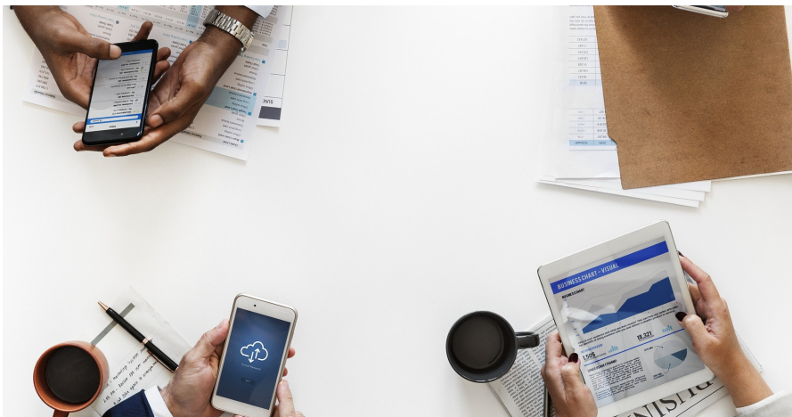
T-Mobile US Inc. and Sprint Corporation are the third and fourth largest mobile wireless networks in the U.S.