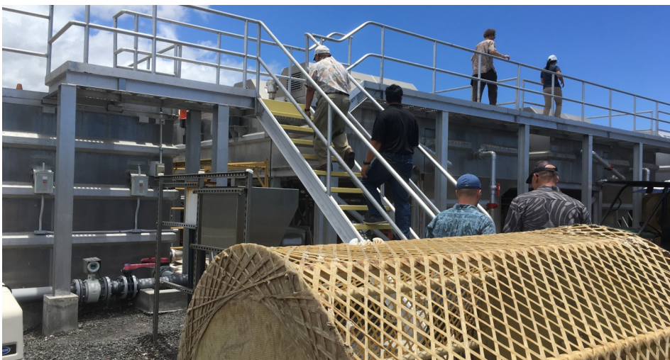
Staff members from DCA and the PUC tour the Kona Water Service Company plant on May 30.