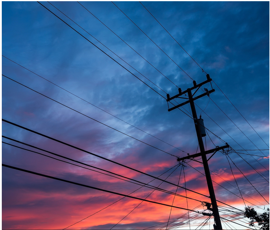
Hawaii Electric Light Company seeks a 3.8 percent rate increase.