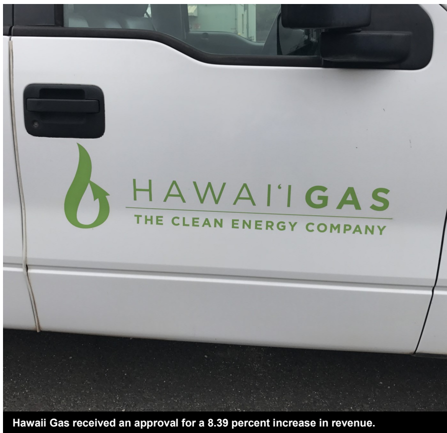
Hawaii Gas received an approval for a 8.39 percent increase in revenue.