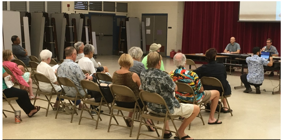
The PUC held a public hearing for the WHUC rate case on June 7 at Waikoloa Elementary and Middle School.