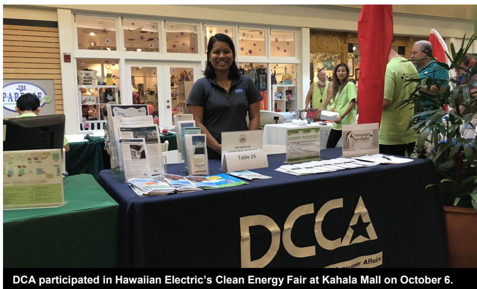
DCA participated in Hawaiian Electric's Clean Energy Fair at Kahala Mall on October 6.