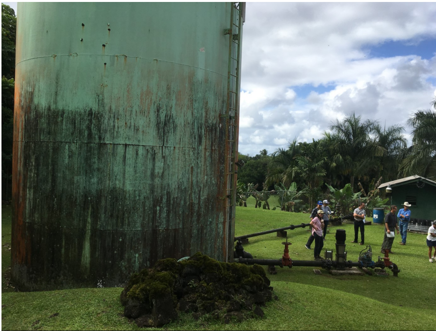
The Consumer Advocate toured the Hana Water Systems facilities on May 21.