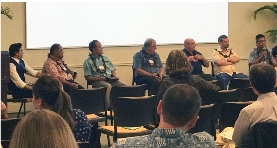
A panel at the 9th Annual Hawaii Clean Energy Day, held on August 28, answers questions from the audience about clean transportation.