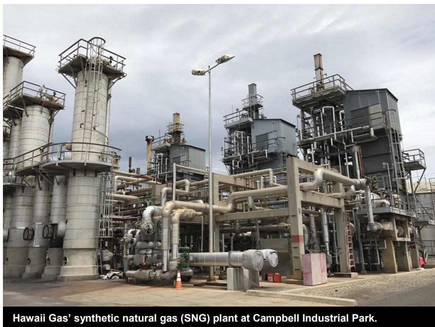
Hawaii Gas' synthetic natural gas (SNG) plant at Campbell Industrial Park.