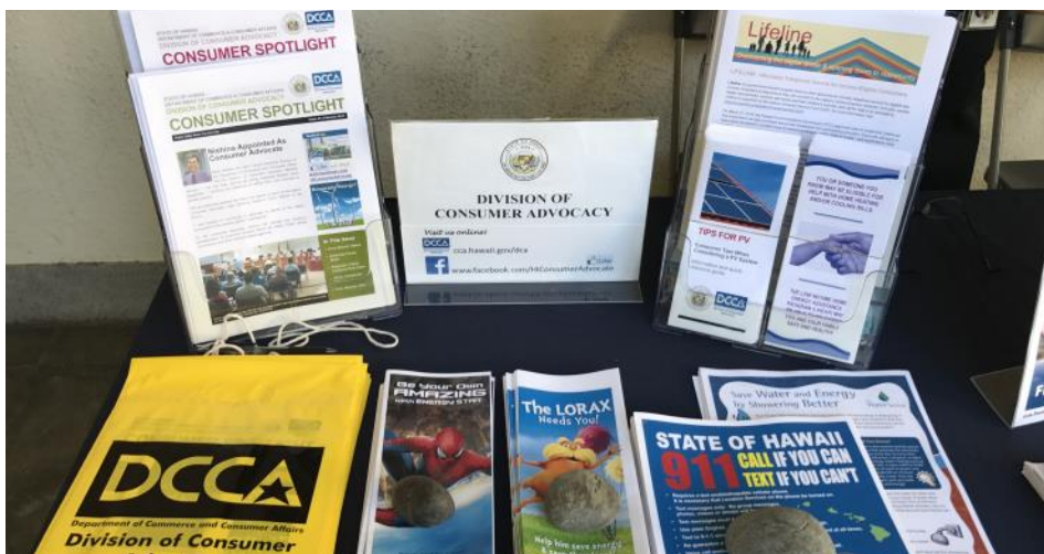
The DCA table at the National Consumer Protection Week Fair held at the King Kalakaua building offered handouts, brochures and copies of its newsletter to the general public.

Like us! Visit: www.facebook.com/HIConsumerAdvocate