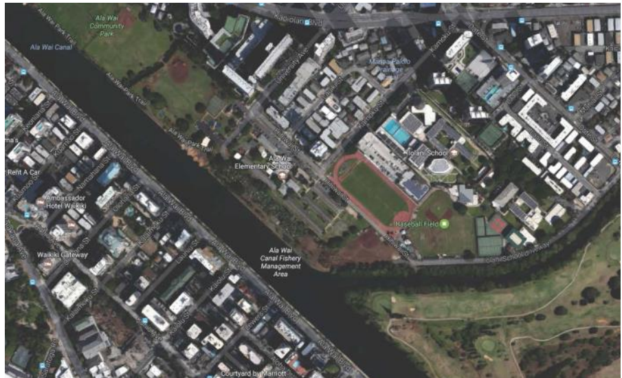
Area of underground line construction project.

Article source: Federal Communications Commission