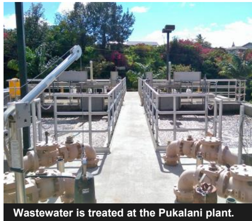
Wastewater is treated at the Pukalani plant.