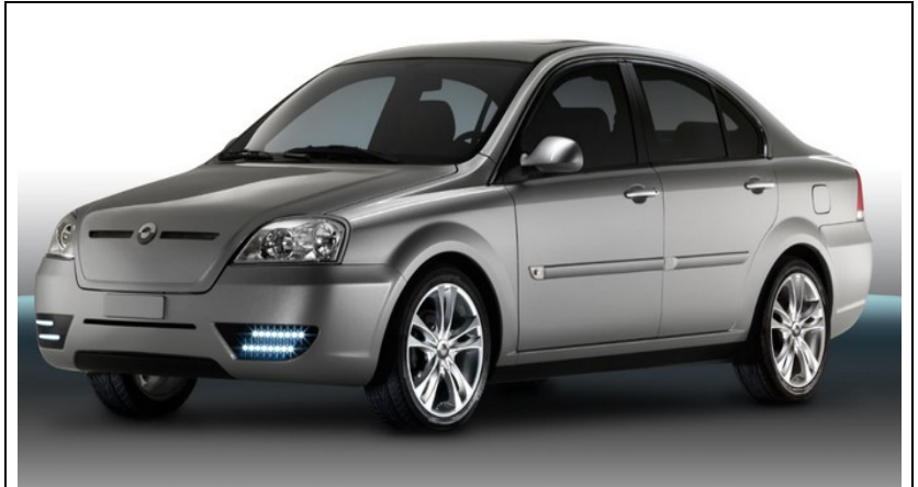
2011 CODA Sedan. One of the rebate qualified electric vehicles

www.hawaii.gov/dbedt/info/energy/evrebatesgrants