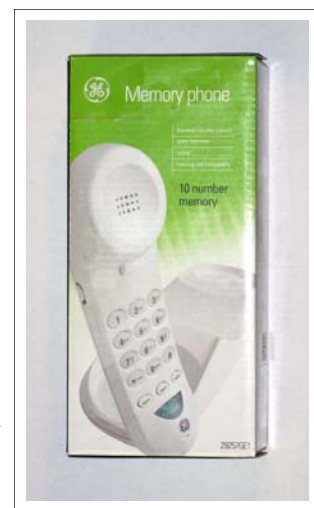
A GE Slimline phone from Hawaiian Telcom.

In the 2nd half of 2008, Hawaiian Telcom provided thousands of its customers with free corded telephones. The company received positive feedback for the phones during and following December's island-wide blackout on Oahu. With cordless phones inoperable without power, and cell phones losing their charge, the free phones came in quite handy. The corded phones run on low-level electrical current provided from Hawaiian Telcom central offices, which have back up power in case of emergencies. This allows you to make calls even during a power outage. Many customers have still not redeemed their coupons so the company decided to extend the program through February at most locations. Coupons should have been included in your June, July or September bill, depending on which island you reside. Those with paperless billing should have received information via email. If you did not receive or lost your coupon, you can still take advantage of the offer as long as your coupon was not redeemed. All you need to do is take a copy of your latest bill along with a picture ID to a Hawaiian Telcom store and a representative will look in their records to see if your allotted phone was issued. The phone giveaway was part of an agreement made when the company sold its print directory business. The phones may also be purchased for $5. You can visit their website for more information.